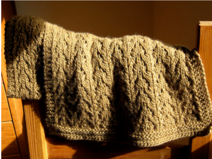
Lacy Prayer Shawl Free!

Faith and life seen through the stitches we make. http://revknits.com