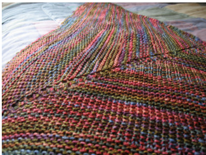
Madame Matisse Shawl