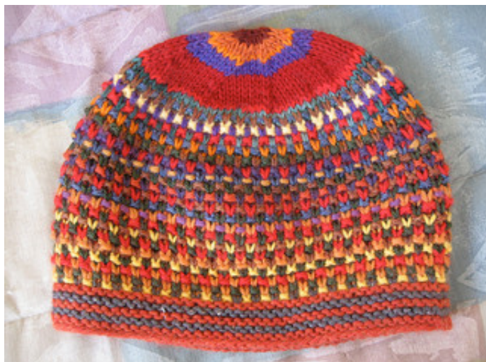
Slip Stitch Stash Hat Free!