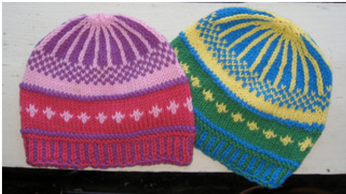
Under the Big Top Baby Hat