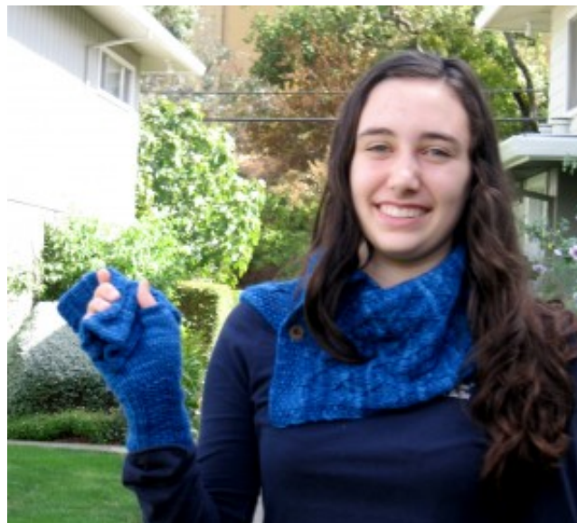
Interlocked Cowl and Fingerless Mittens