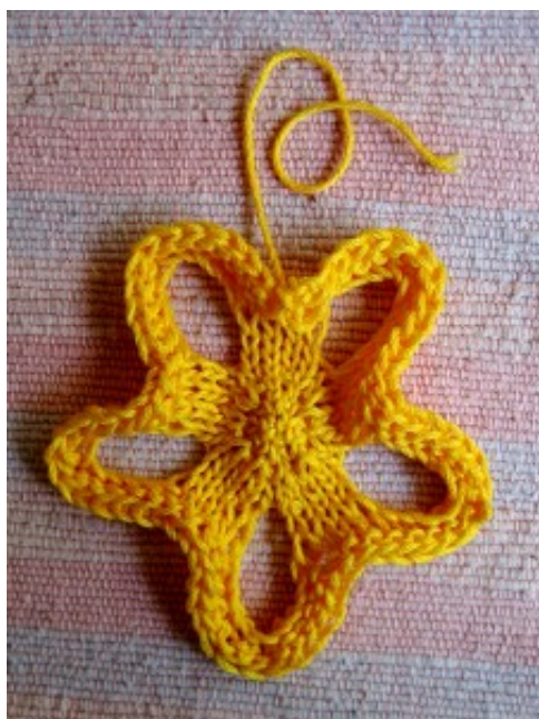
Starfish Pattern Free!